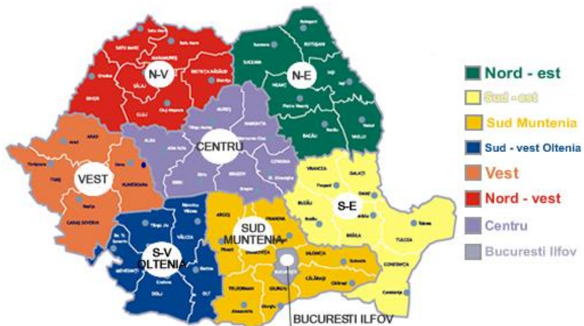
Fig. 1. Romania's development regions