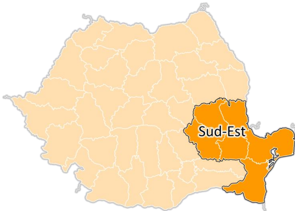
Fig. 2. The SE Region

The 2TH region comprises almost all forms of relief, and the opening at the Black Sea gives the opportunity to develop maritime and river-maritime transport, and is also an element of attracting foreign investment.