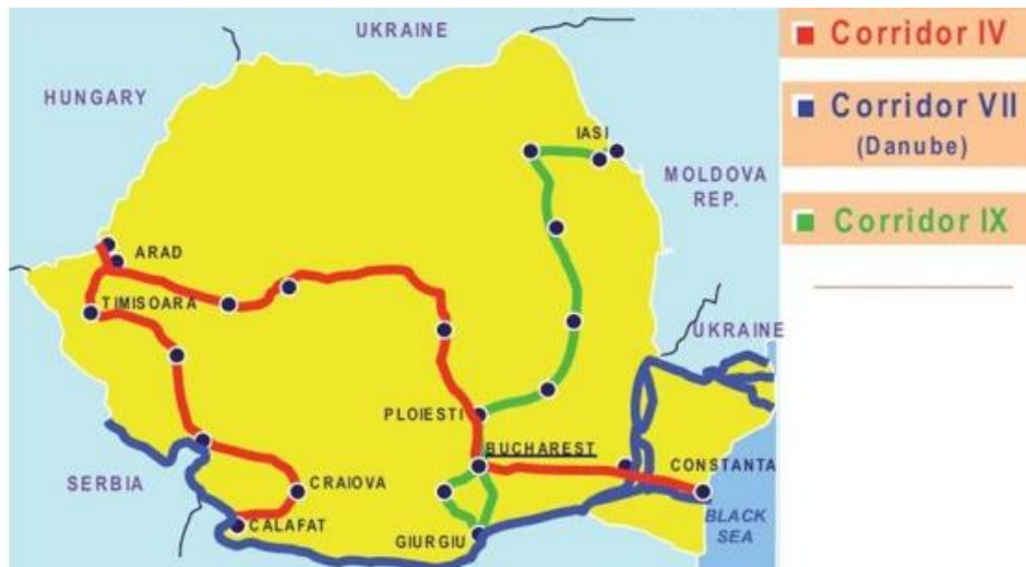
Fig. 4. Transport Corridors in Romania